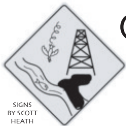
SIGNS BY SCOTT HEATH